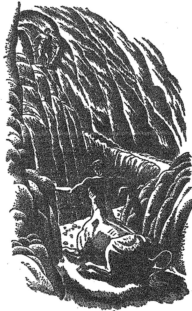
The Minotaur in the Labyrinth

So Theseus became King of Athens, a most wise and disinterested king. He declared to the people that he did not wish to rule over them; he wanted a people's government where all would be equal. He resigned his royal power and organized a commonwealth, building a council hall where the citizens should gather and vote. The only office he kept for himself was that of Commander in Chief. Thus Athens became, of all earth's cities, the happiest and most prosperous, the only true home of liberty, the one place in the world where the